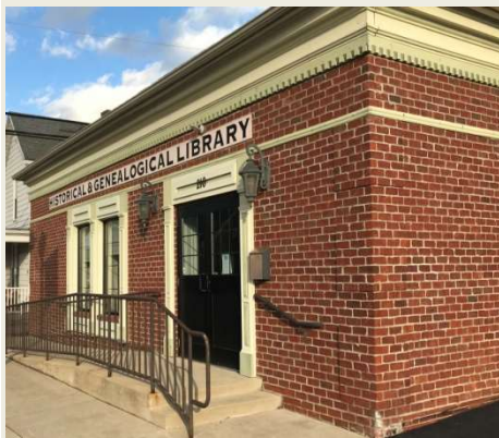
Your source for local history